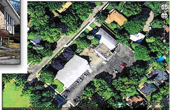
(Aerial view of Port Nelson from Google Earth)

"Gathering, Seeking, Responding, Reaching Out"